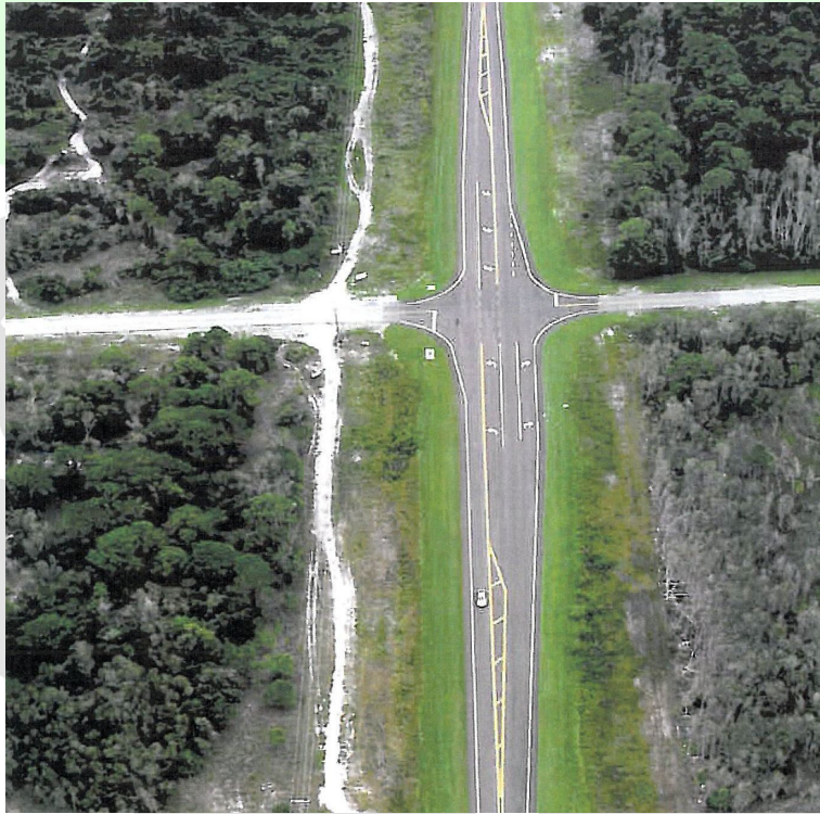
State Road 82 From a point West of Sunshine BLVD to a point west of Columbus Blvd, Lee County