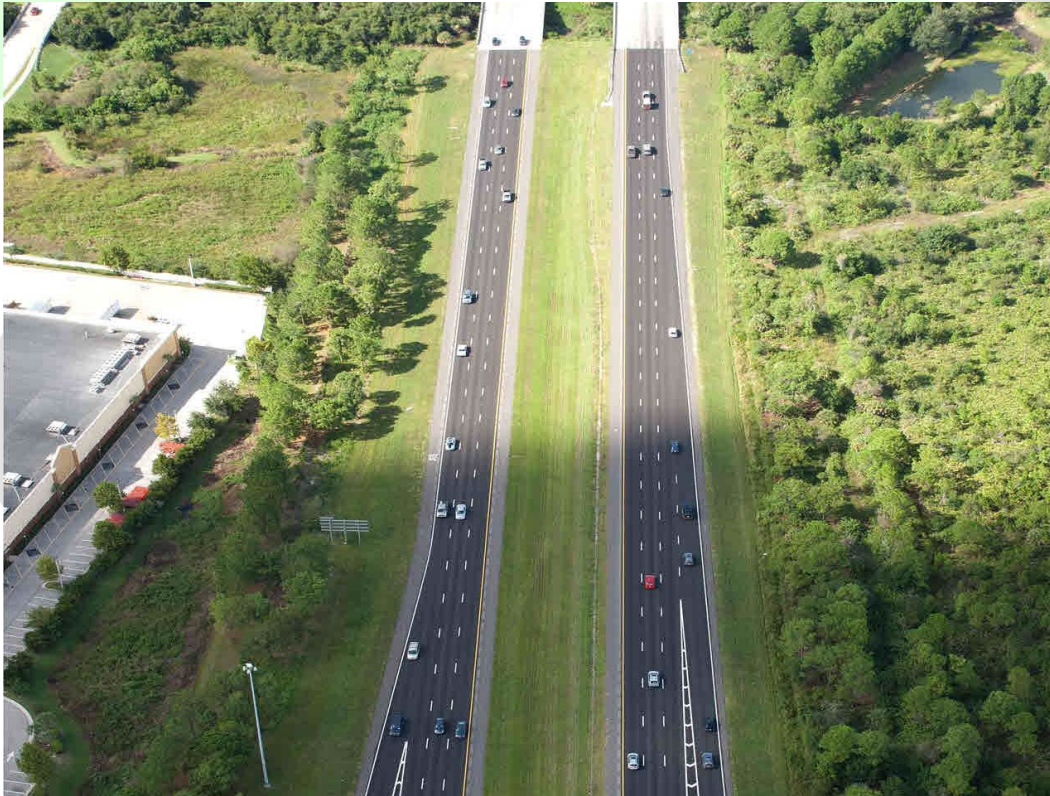
I-75 in Manatee County