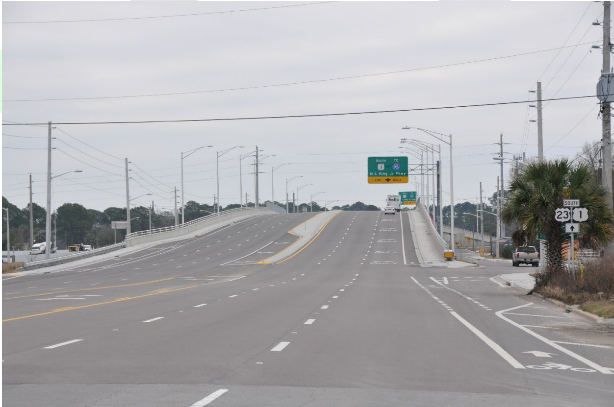
New Kings Railroad Overpass between W25th and 20th Street