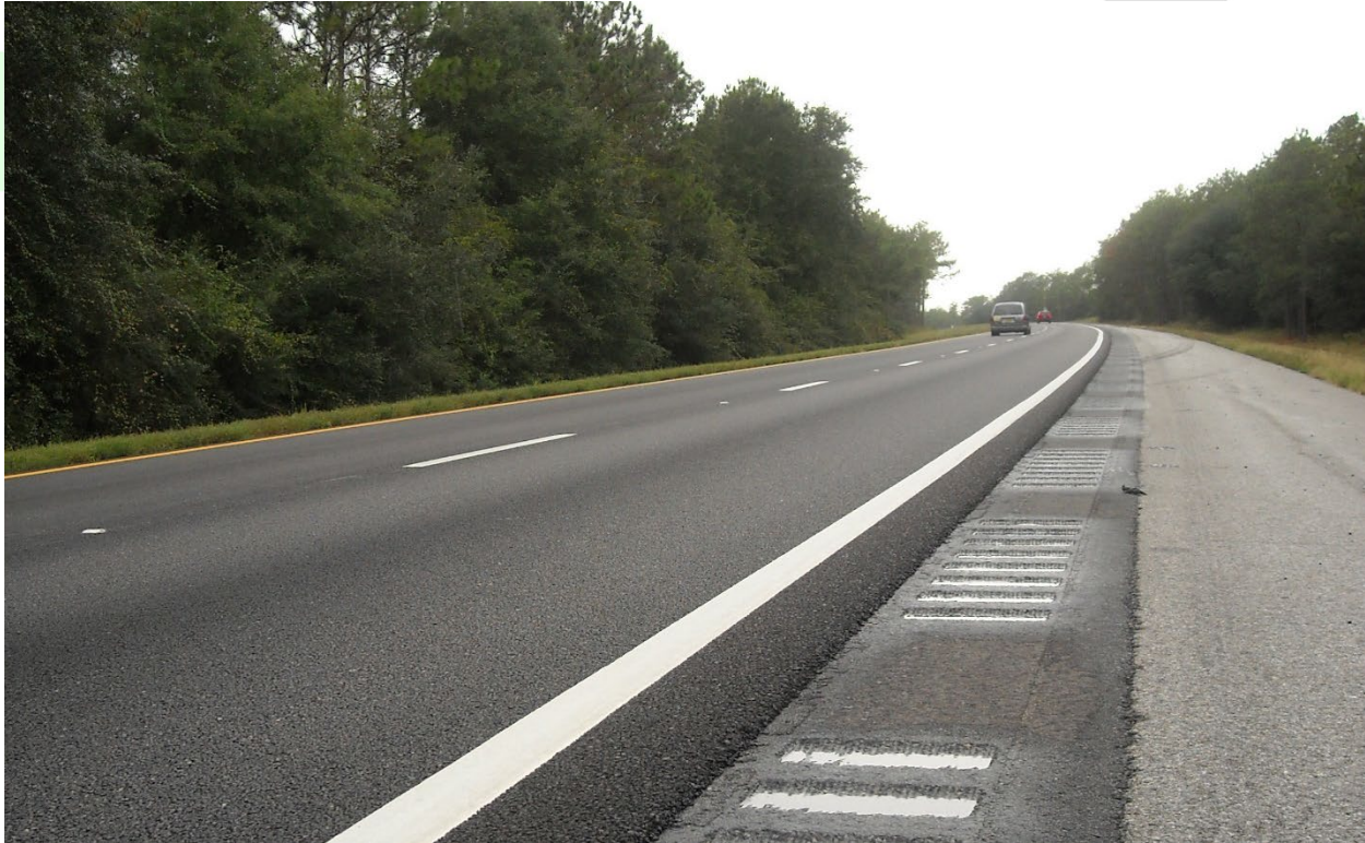
SR-8 / I-10 from East of the Shoal River Bridge, east to the Okaloosa/Walton County line.