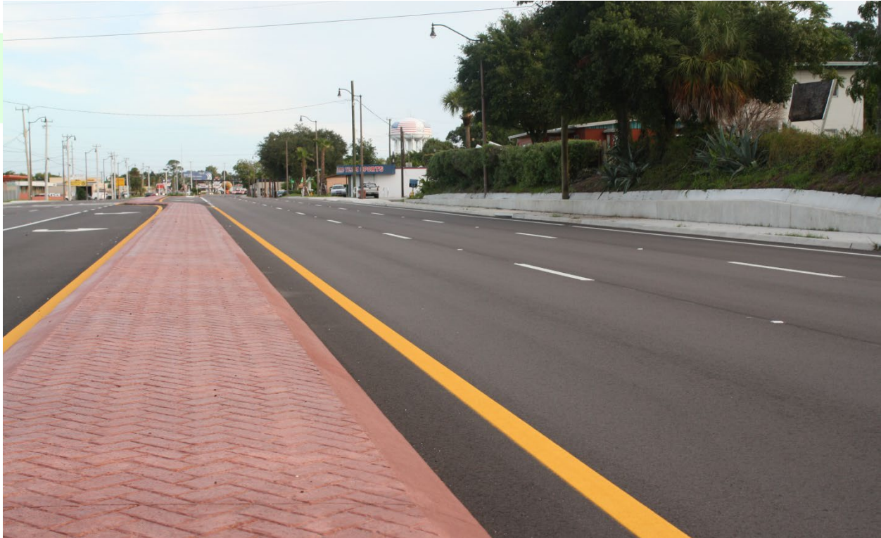
Highway US-1 Rockledge/Cocoa, Job runs on US-1 from Brunson Road to Path Street