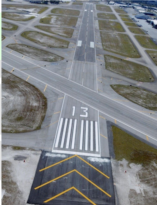
Fort Lauderdale Executive Airport Runway