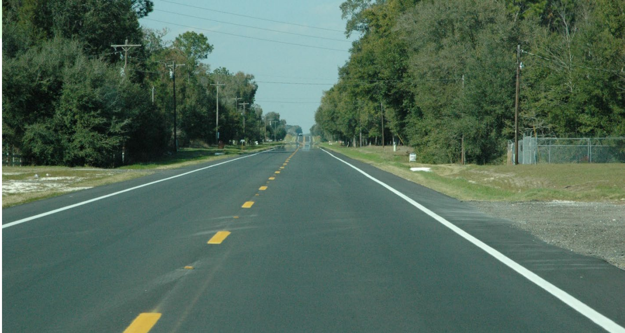
SR 45 (US41) from the Marion/Levy County line to a point north of SW 5th Ave. in Williston, FL