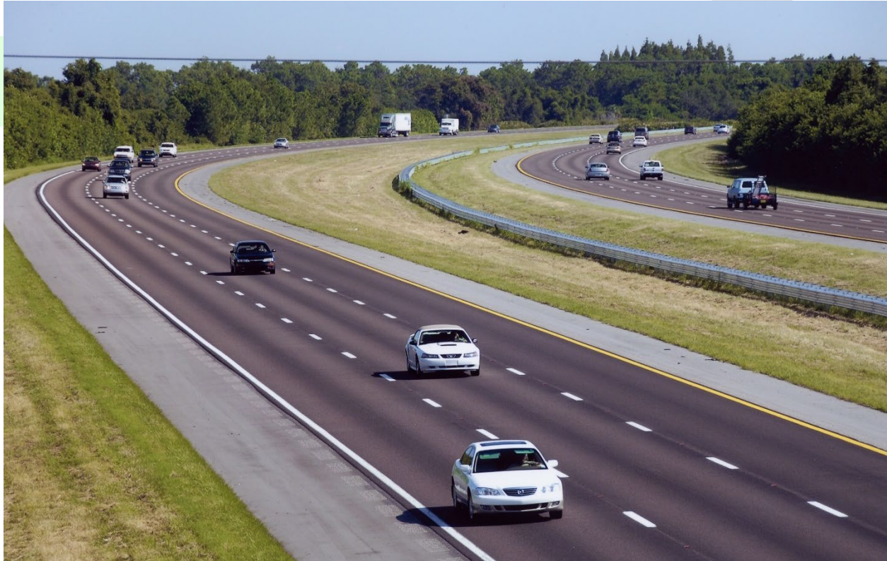
State Road 93A (I-75) From SR 674 (Sun City Center) to CR 672 (Big Bend Road)