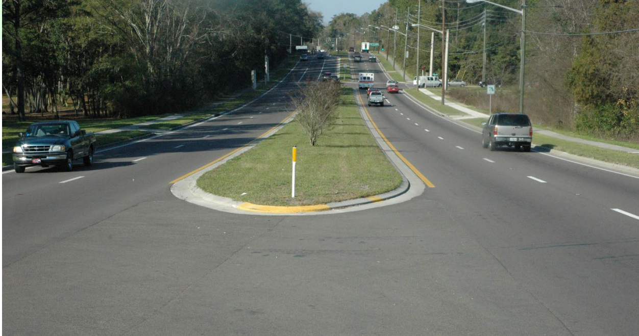
SR26(Newberry Rd) From a point west of 109th st. to NW 80th Blvd.- Gainesville FL