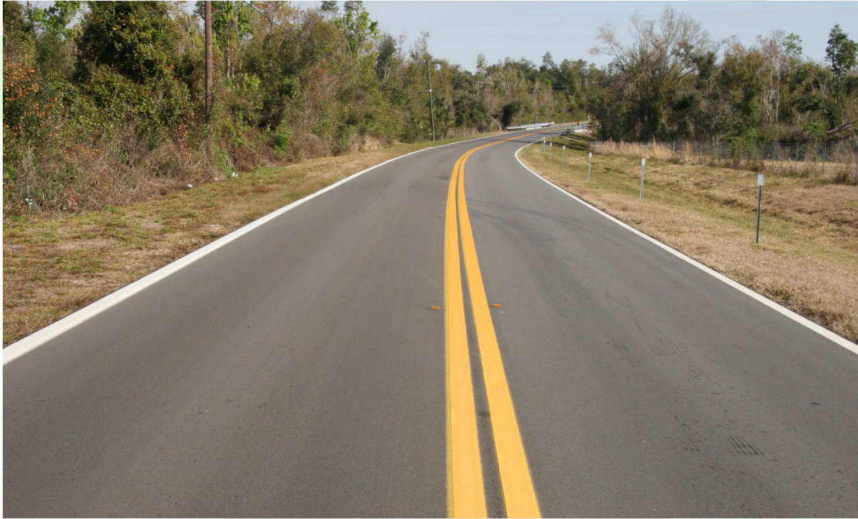
SR 35/Old US 17 Desoto County. From a point south of Turner Ave to a point north of Crystal Street.