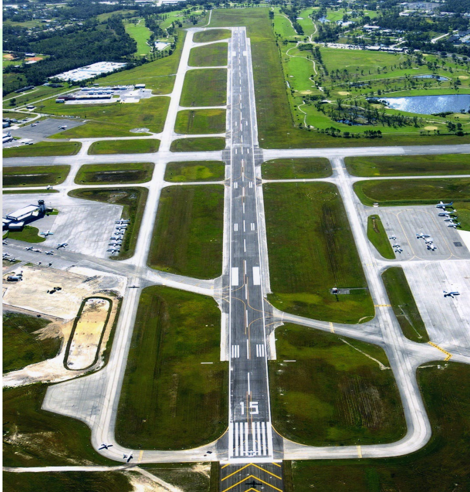
Kissimmee Gateway Airport

Orlando Paving Company A Division of Hubbard Construction Company