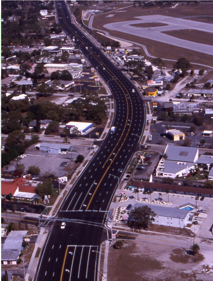
US-41 from Sarasota County Line to Bowlee's Creek