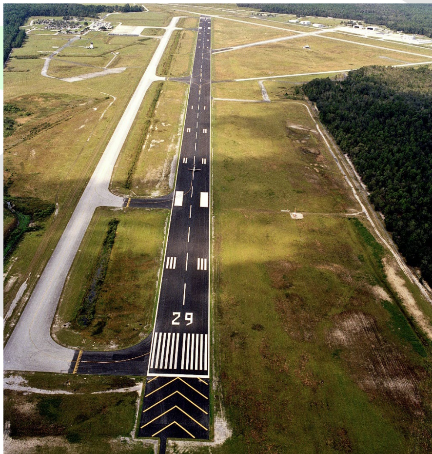
Runway 10-28 Rehabilitation