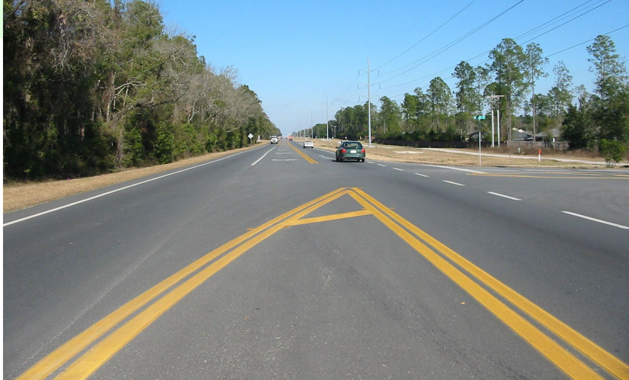
SR-24 (Archer Road) from the town of Archer, Florida to SW 85th Avenue in Alachua County