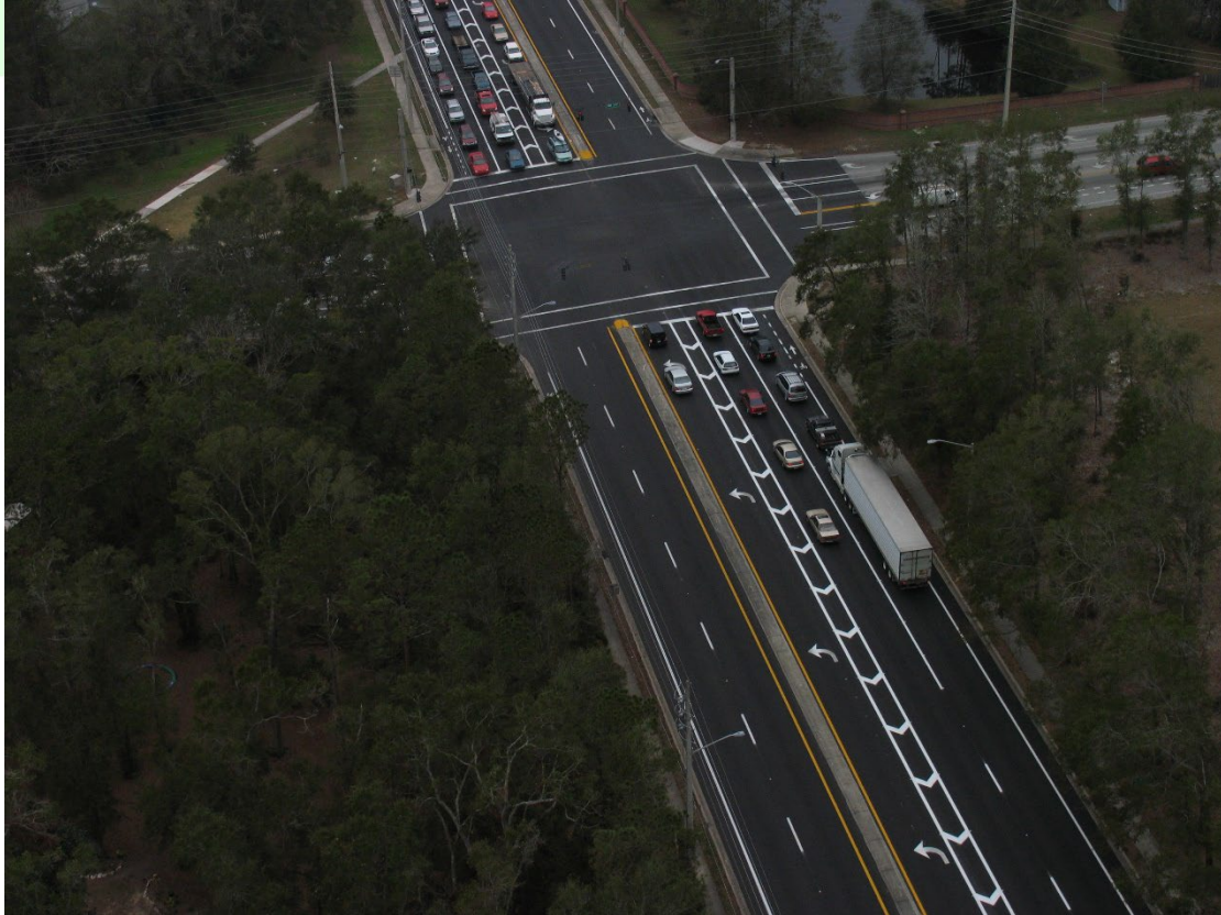
SR-222 (NW 39th Ave.) Gainesville, Florida from NW 43rd Street to West of NW 24th Street