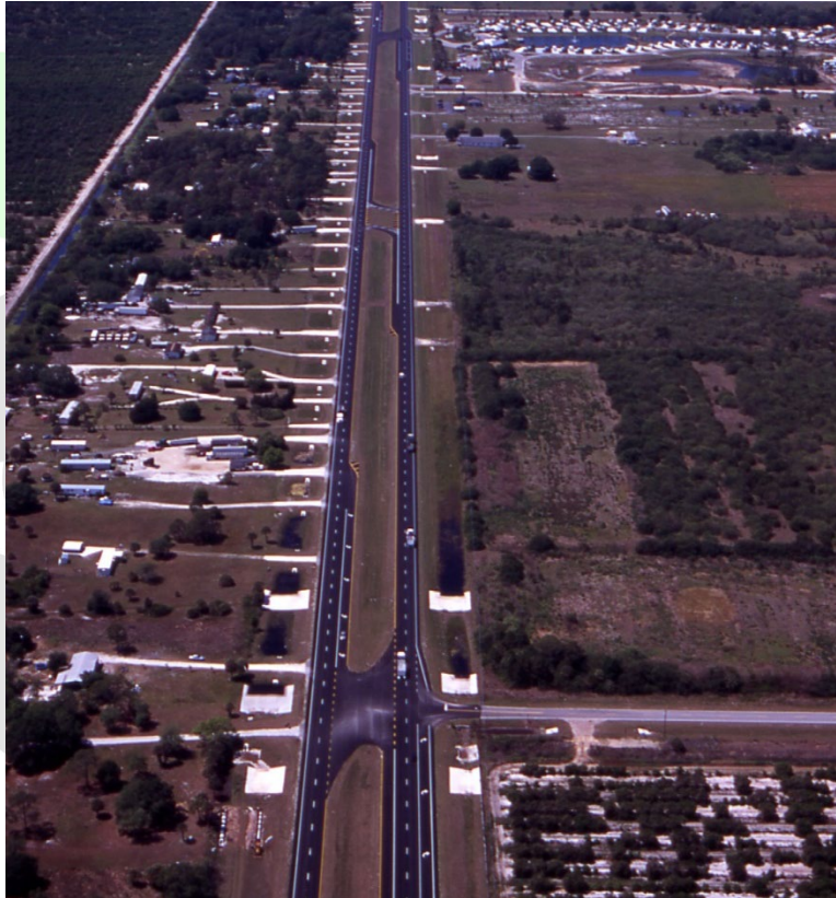
SR-80 starting at Lee/Hendry County Line and ending at a point east of CR-78A