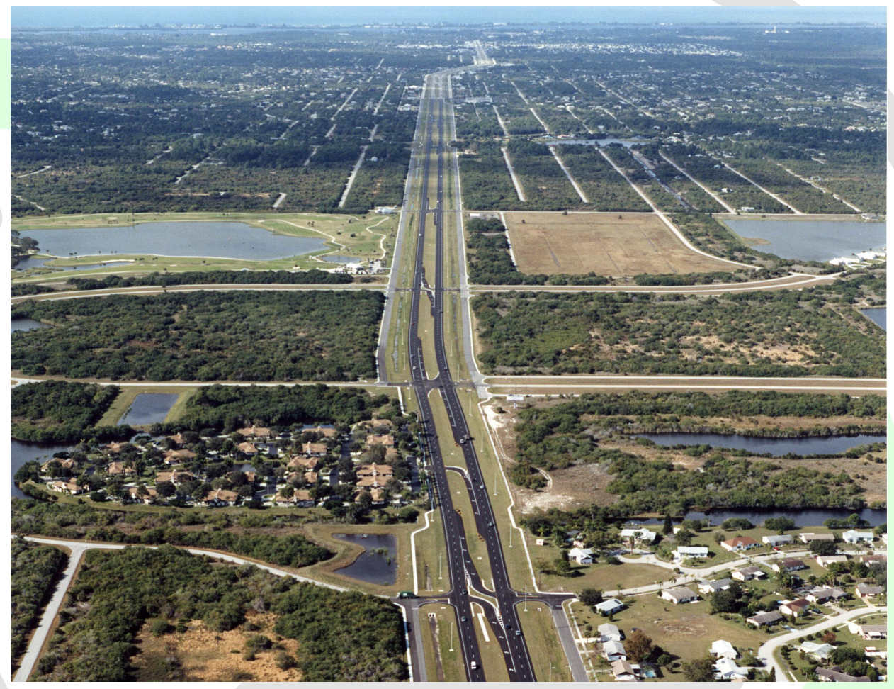
Englewood, SR 776 from Sunnybrook Blvd. To C.R. 771