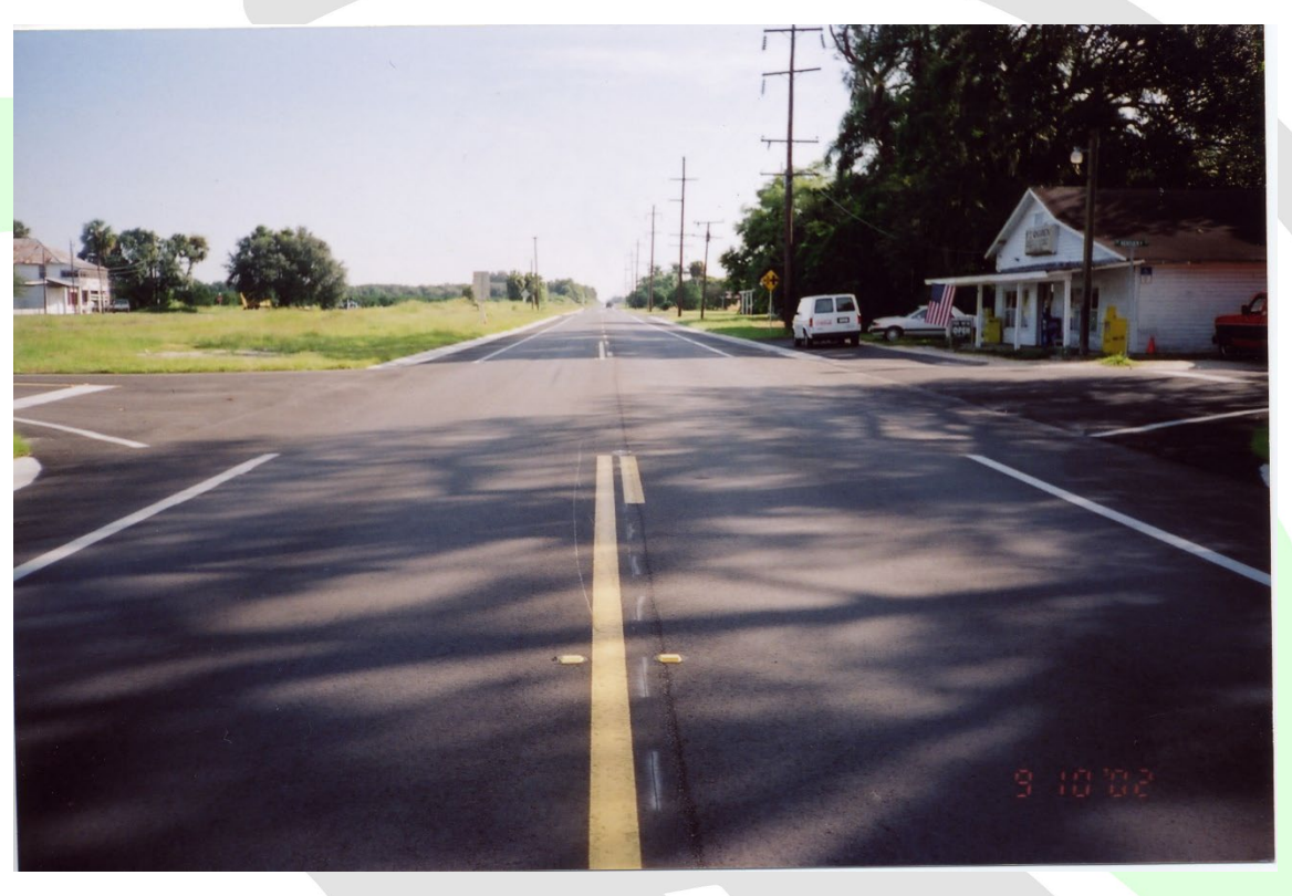
SR 35 (US 17) From River Street to CR 760 A