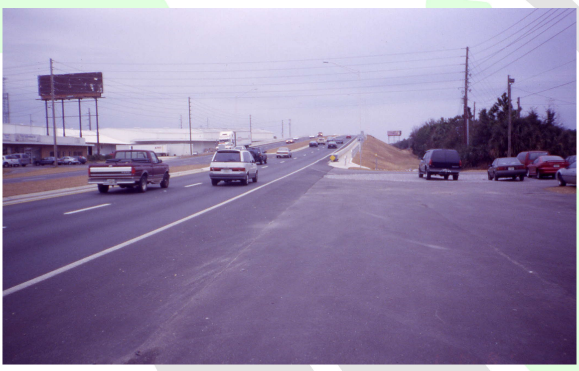
SR 295/30 (US 98) Navy Blvd.