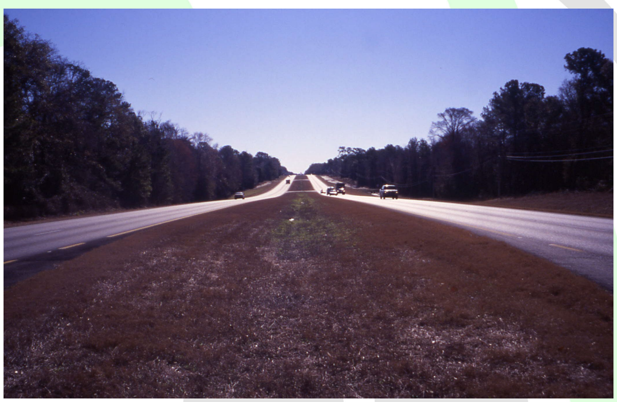
SR 24 from NE 55th Place in Gainesville, FL to US 301 in the City of Waldo, FL