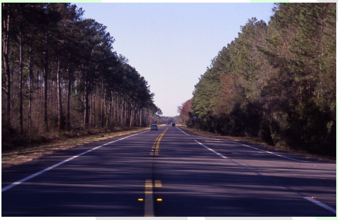
SR 121 from SR 25 (US 441) in Gainesville, FL to the Town of LaCrosse