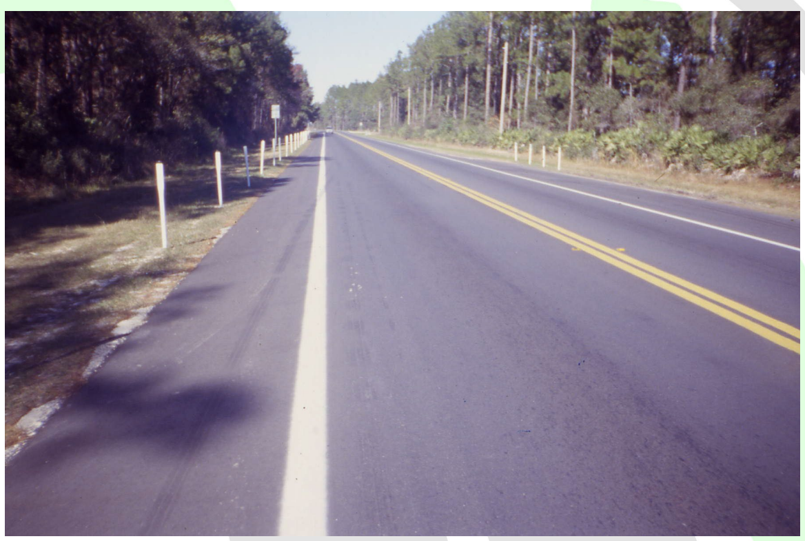
SR-326 from US-441 to SR-40

Marion County Tonnage - n/a Lane Miles - n/a