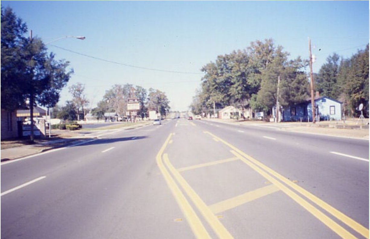
SR 85 (Ferdon Blvd) from Brock Ave to SR 10 (US 90)