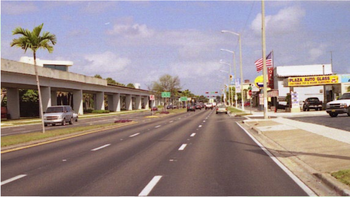
US 1 from SW 80 St. to Riviera Dr. Miami FL