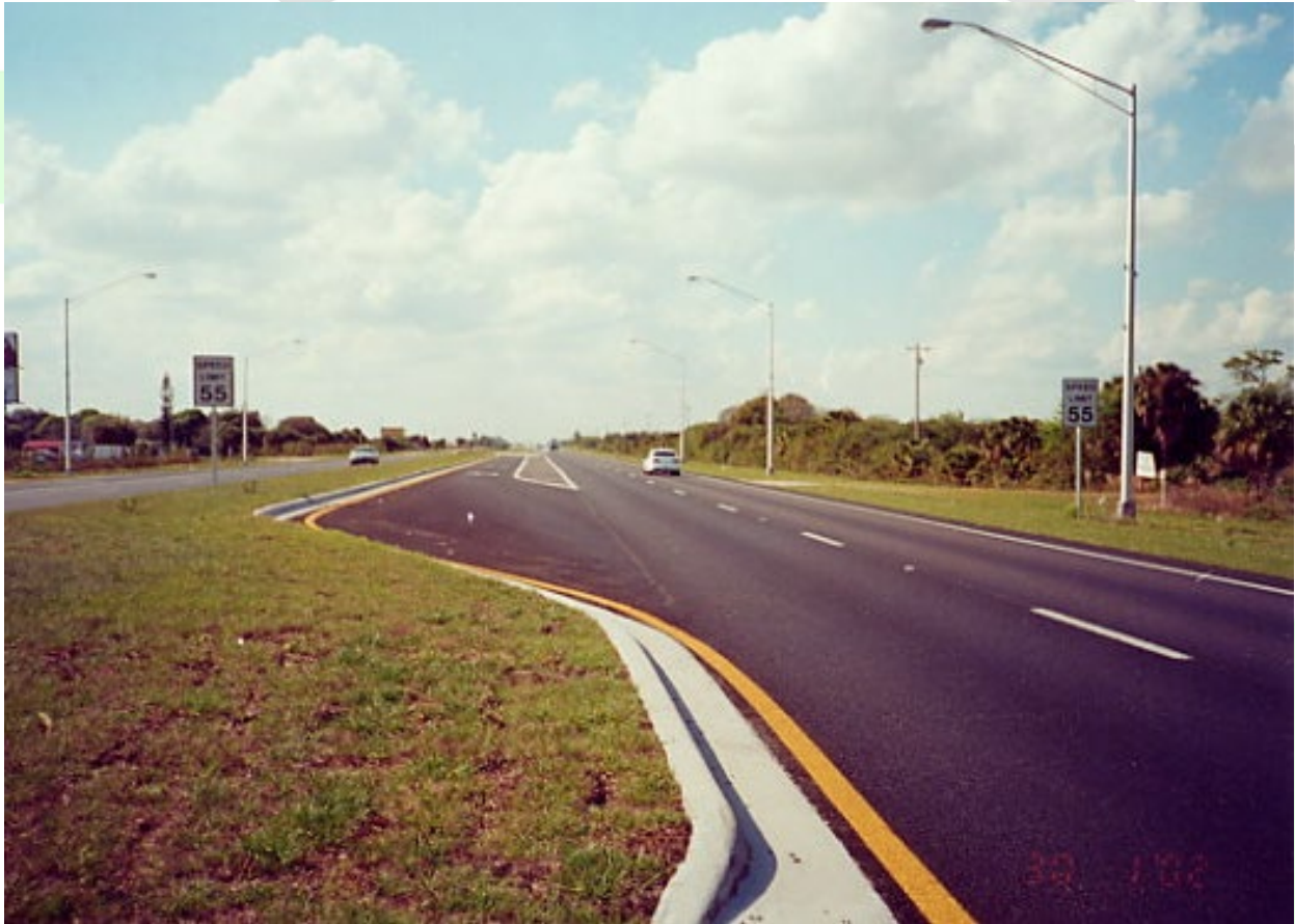
SR 25 (US 27) from 5th street to SR 78