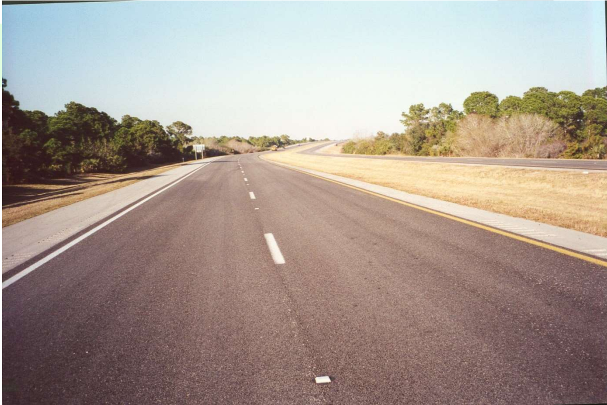
State Road 681 (I-75) to US 41, The Venice Connection Sarasota County