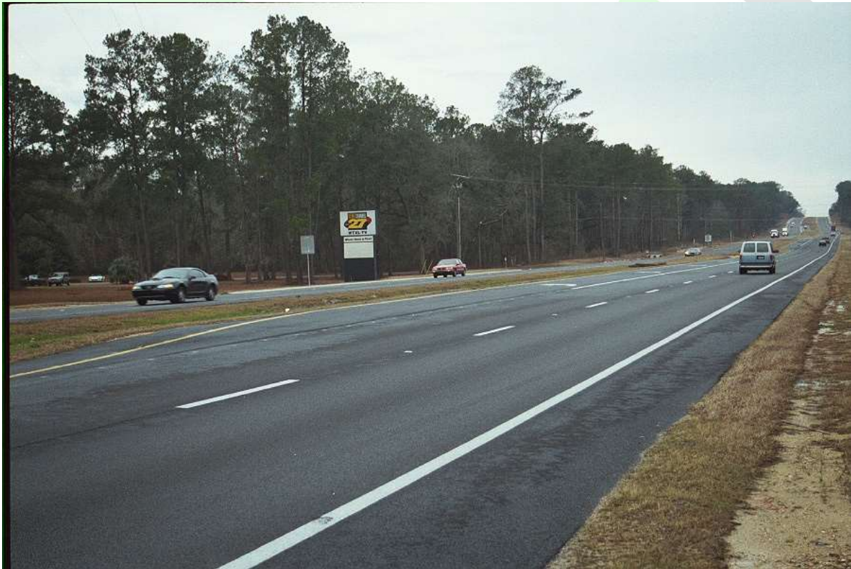
US 319 From Bradfordville Road to a point 5 miles north Leon County