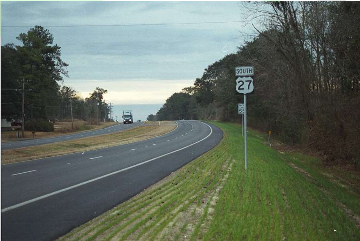
US 27 From Havana City Limits to Ochlockonee River Bridge Gadsden County