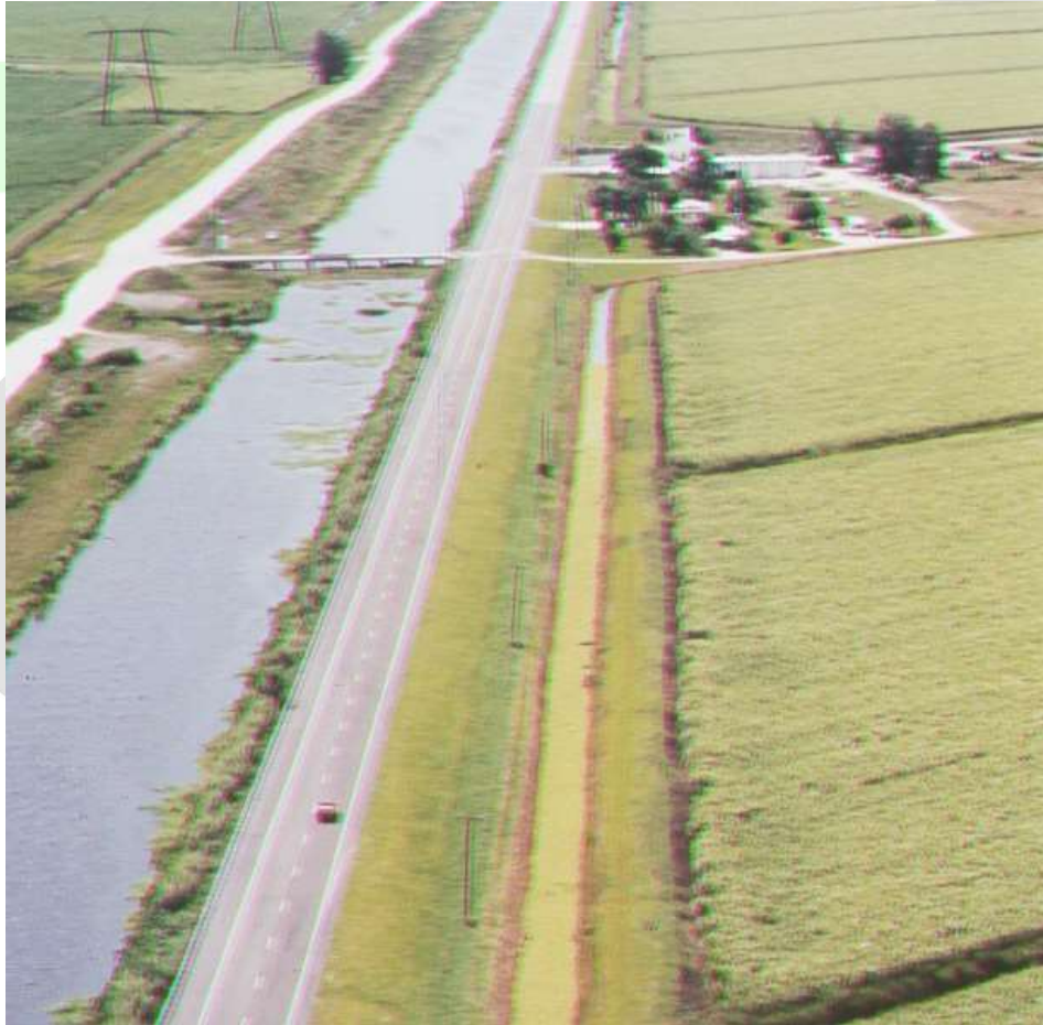
State Road 700 (US-98) Conners Highway