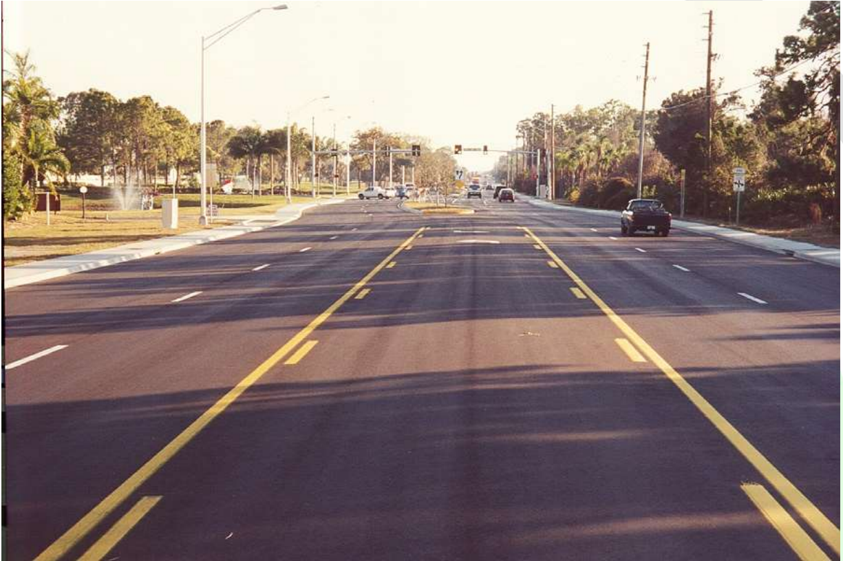
75th St. West from Cortez Road to Manatee Ave. Manatee County