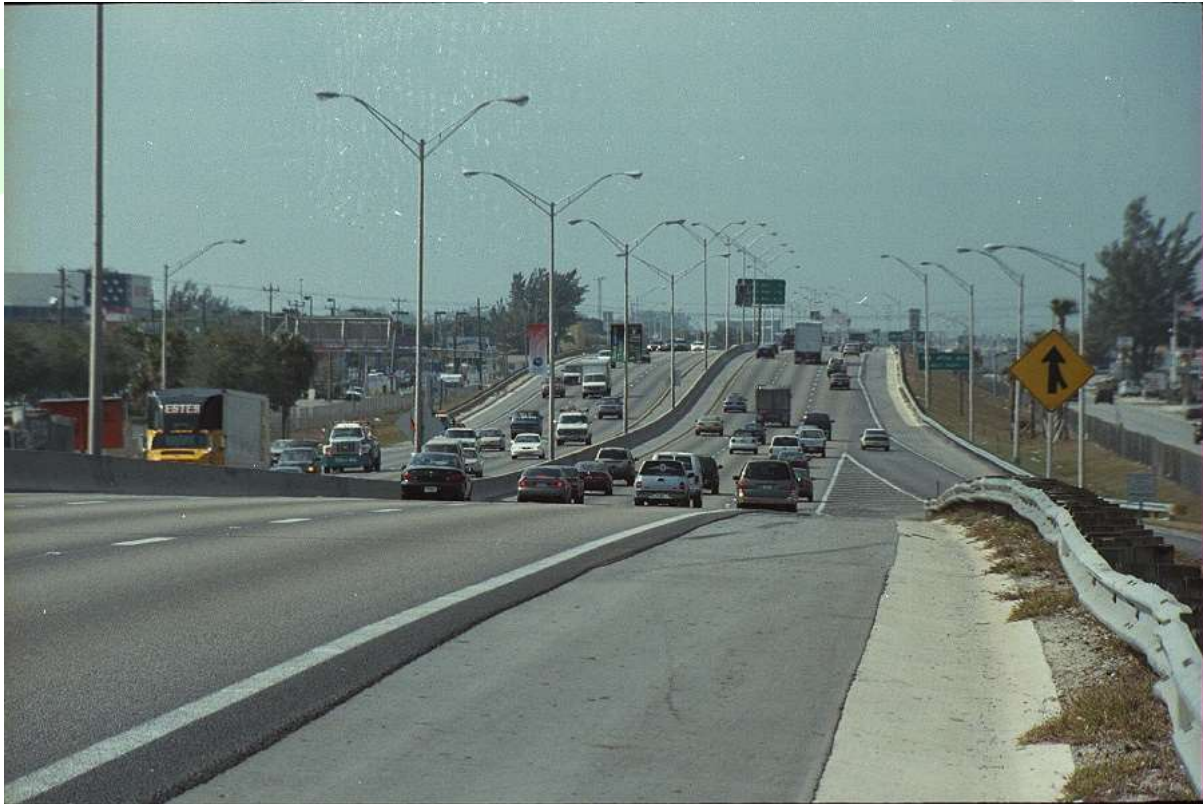
State Road 826 (Palmetto Expressway) from NW 51st Place to NW 30th Ave.