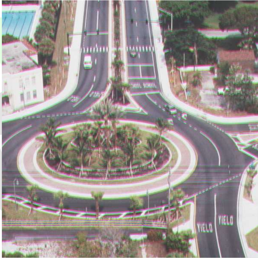
State Road 802 Lake Worth Road Roundabout Palm Beach County