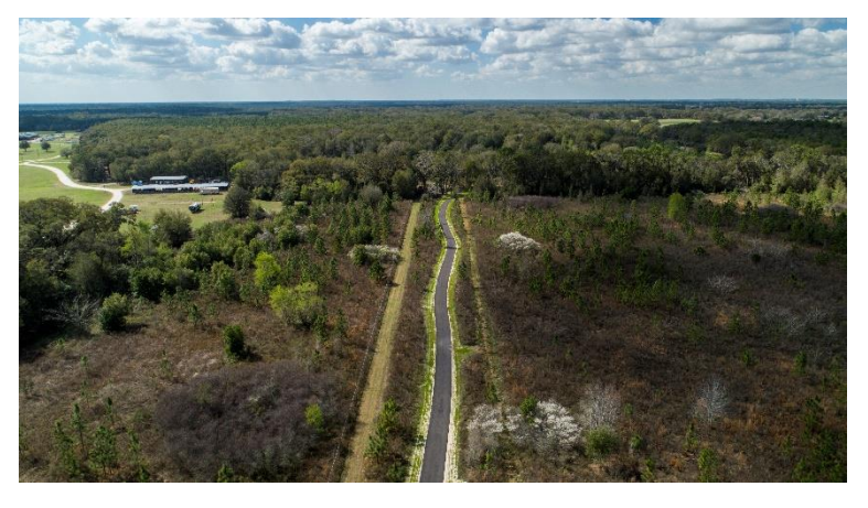
District 5: D.A.B. Constructors for their project on Bike Trail from SW 49<sup>th</sup> Ave. to Santos Trailhead in Marion County. Tonnage: 5731.68, Lane Miles: 10.07

These winning awards are selected from Member companies that have submitted projects that were completed by the first of the current year. Asphalt is the primary form of highway pavement in Florida. It is also approximately 99% of the Florida's pavements and 94% of the U.S. Highways. Asphalt is clearly the pavement of choice by paving professionals around the country. It is a proven performer, can be customized to any paving application, and has the lowest life cycle cost.