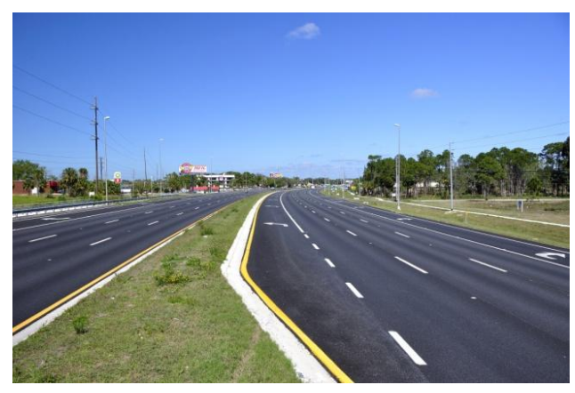
District 7: D.A.B. Constructors for their project on SR 55 from SR 52 to Pasco Hernando County Line in Pasco County. Tonnage: 86215, Lane Miles: 63.2

These winning awards are selected from Member companies that have submitted projects that were completed by the first of the current year. Asphalt is the primary form of highway pavement in Florida. It is also approximately 99% of the Florida's pavements and 94% of the U.S. Highways. Asphalt is clearly the pavement of choice by paving professionals around the country. It is a proven performer, can be customized to any paving application, and has the lowest life cycle cost.