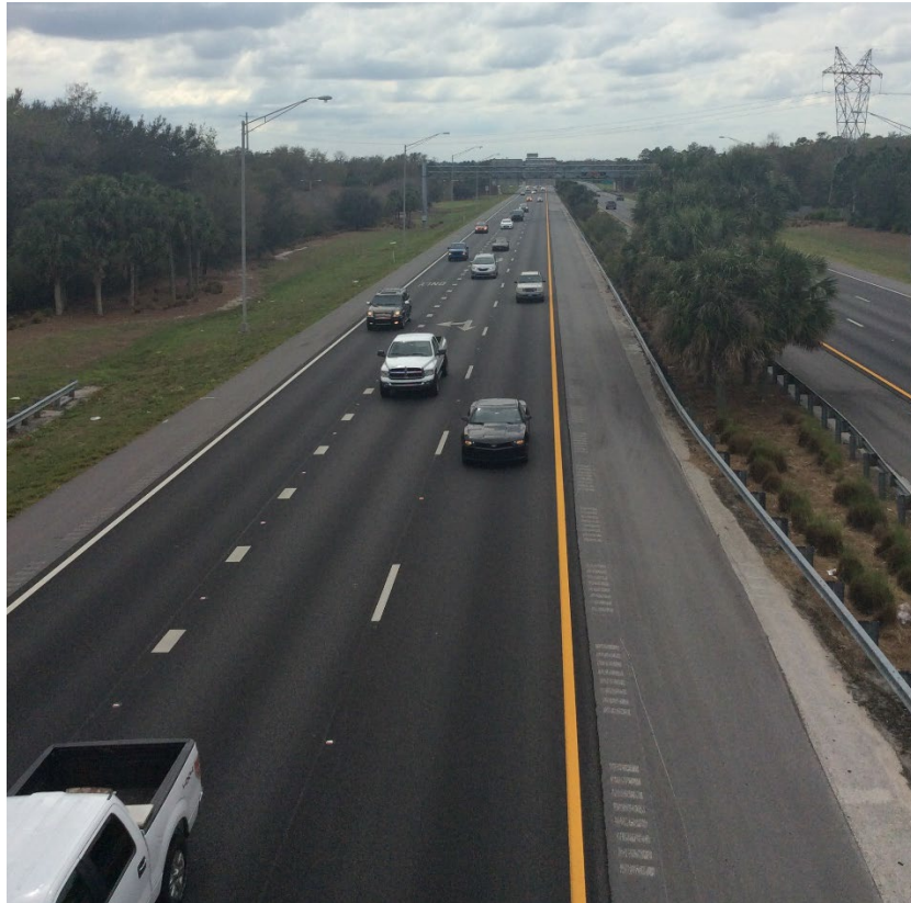
SR 417 from SR 50 to Orange/Seminole County Line