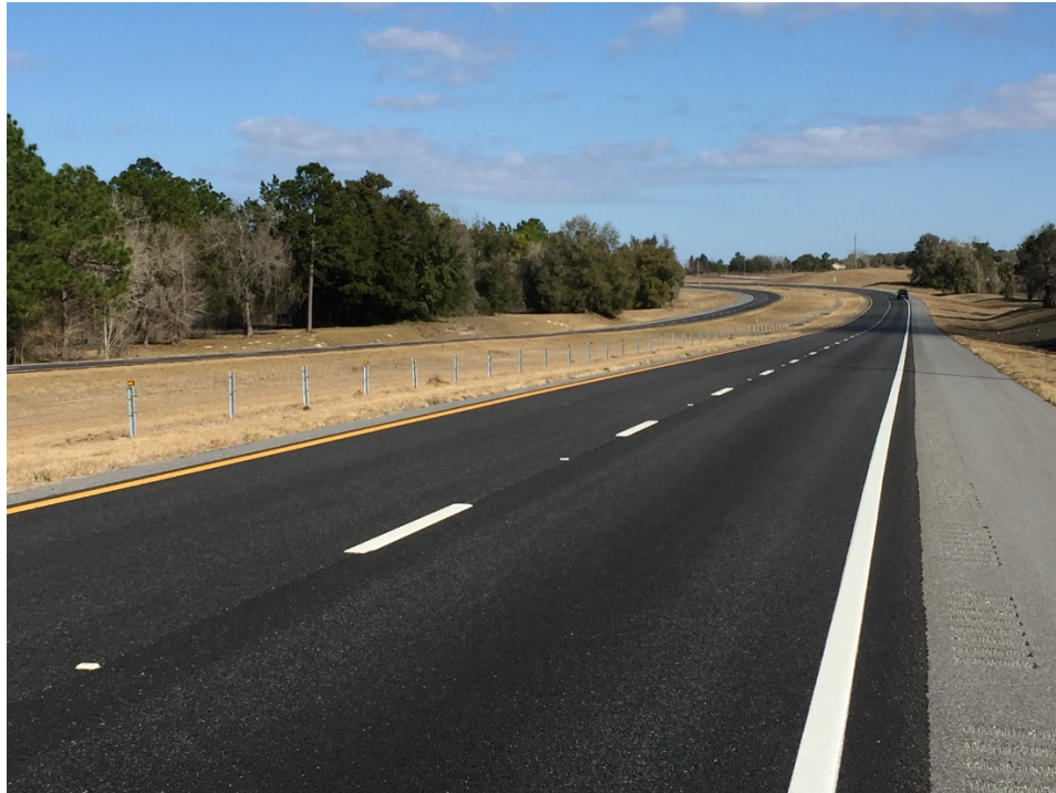
SR 589 From SR 50 to US 98