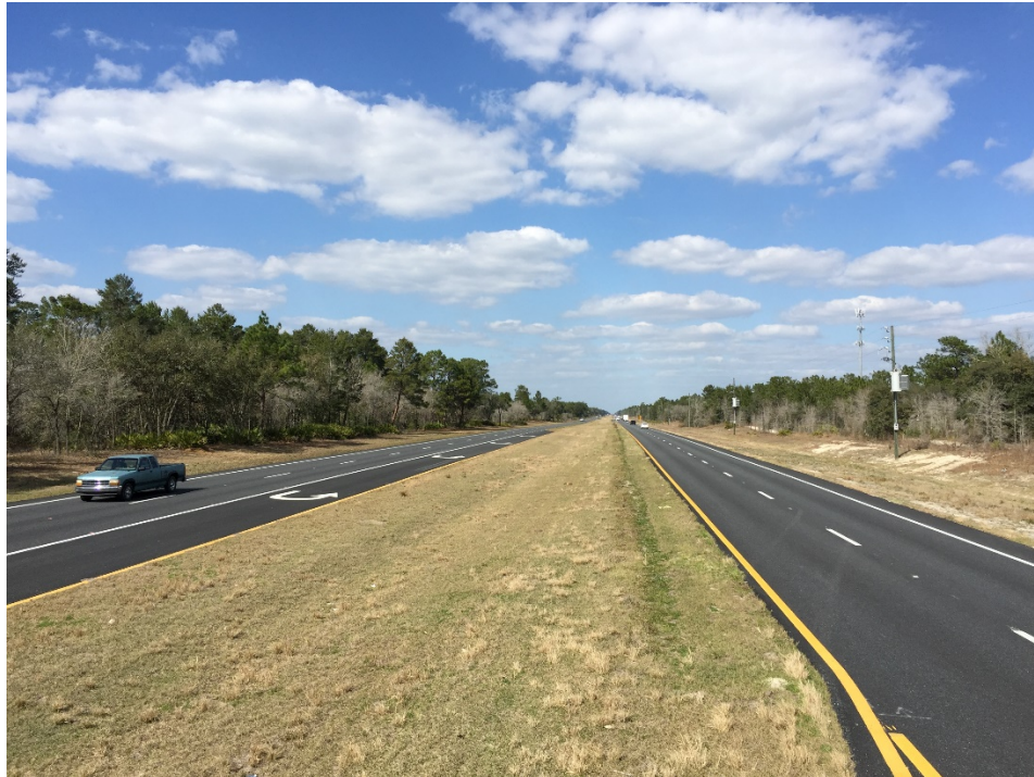
SR 55 From SR 50 to Citrus County Line