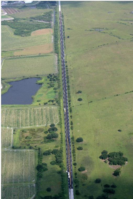
SR 60 From the Turnpike to Hyatt Farms Rd.