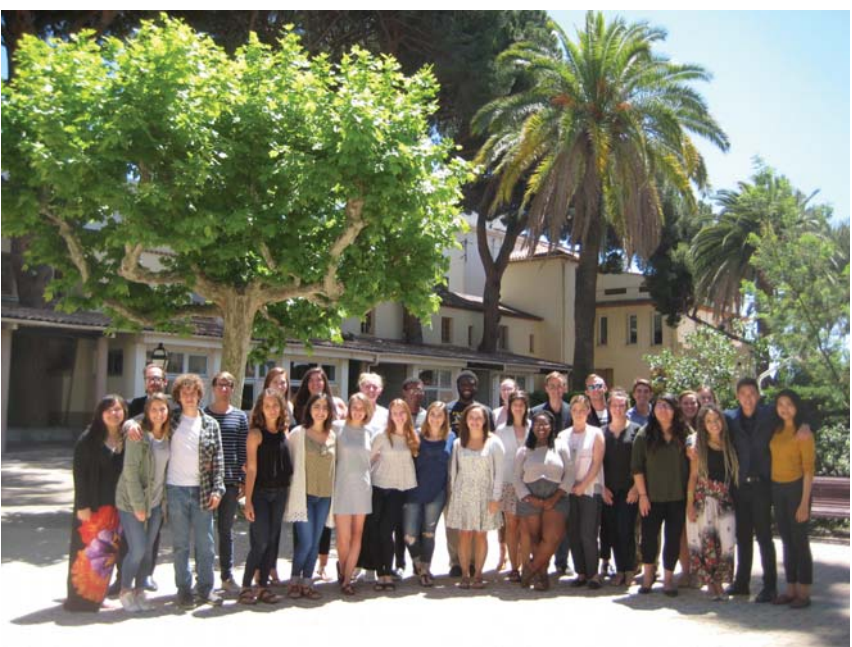
Les étudiants au Campus international de Cannes

À la fin du semestre, tous les étudiants recoivent au moins une option (minor) en français. Mais plusieurs d'entre eux décident de se spécialiser en français au niveau du bachelor et même de poursuivre avec un master. À en juger par les commentaires élogieux des évaluations qu'ils remplissent, ils sont toujours enchantés de leur séjour à Paris et à Cannes. Il faut dire que l'équipe de direction et le personnel du CIC sont courtois, efficaces et accommodants. Et les étudiants soulignent particulièrement la qualité de l'enseignement qu'ils reçoivent au CIC. Je recommande vivement cet établissement à tout professeur désireux d'y organiser un programme de courte ou longue durée en France car les services y sont excellents, sans parler de sa situation géographique et des manifestations offertes par la région. Ce semestre d'études remporte toujours un véritable succès et son impact se traduit par une augmentation du nombre d'inscrits aux niveaux de notre bachelor et de notre master en français. Je ne peux donc qu'encourager les enseignants à se lancer dans cette aventure qui s'avère enrichissante à tout point de vue.