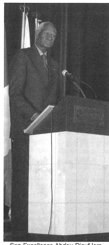
Son Excellence Abdou Diouf lors de la séance inaugurale

plénières ont été présentées par d'éminents spécialistes. J'ai moi-même participé à une table ronde intitulée «Le rôle et la place de la langue française dans la vie politique, économique, sociale et culturelle dans un monde mondialisé» et donné une commu-