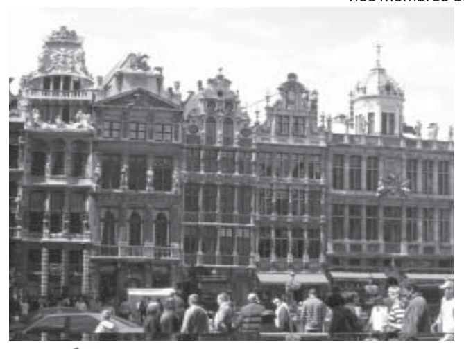
La Grand-Place à Bruxelles