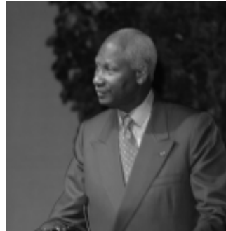
M. Abdou Diouf

opérateurs de la Francophonie . Later, attendees were able to get a first look at the 70 exhibits during a Wine and Cheese Reception. Monday evening, chanteur, compositeur et auteur cadrien Zachary Richard entertained participants with a concert of musique américaine francophone . He had everyone on their feet dancing and received a standing ovation.