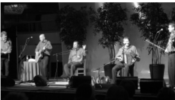
La Grand' Débâcle