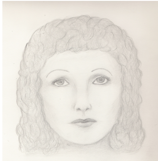
Figure 2. Drawing of Edith Piaf by Sharon M. Bagatta © 2010

was a member of the Resistance, as she later claimed, but it is believed that she helped a number of individuals (including at least one Jew) escape Nazi persecution. She dated a Jewish pianist during the war and, with Marguerite Monnot, co-wrote this subtle protest song, “Où sont-ils mes petits copains ?” Moreover, she defied the Nazi request to remove it from her repertoire. According to one story, Piaf posed for photographs with French prisoners of war, and their images were later used to create false documents, enabling some of them to escape (Silver 9).