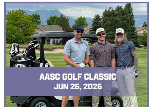
AASC GOLF CLASSIC JUN 26, 2026