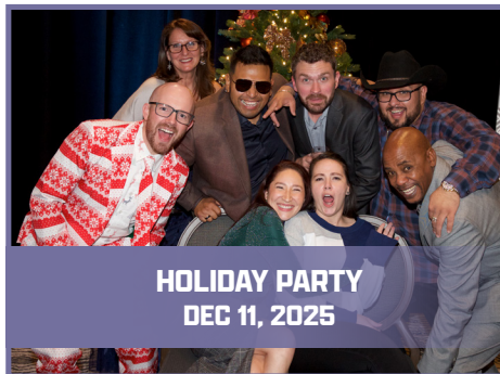
HOLIDAY PARTY DEC 11, 2025