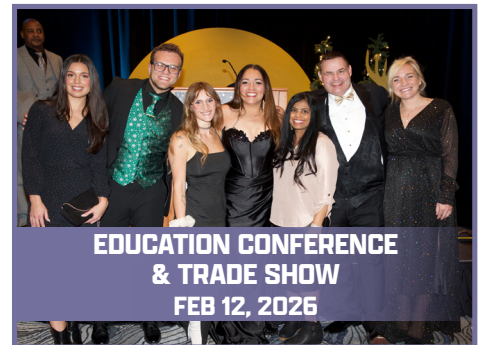
EDUCATION CONFERENCE & TRADE SHOW FEB 12, 2026