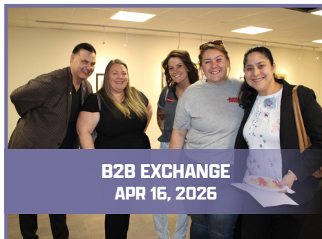
B2B EXCHANGE APR 16, 2026