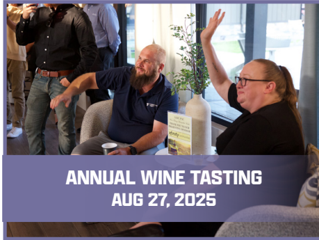
ANNUAL WINE TASTING AUG 27, 2025