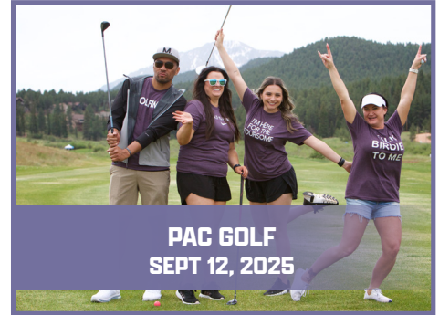
PAC GOLF SEPT 12, 2025