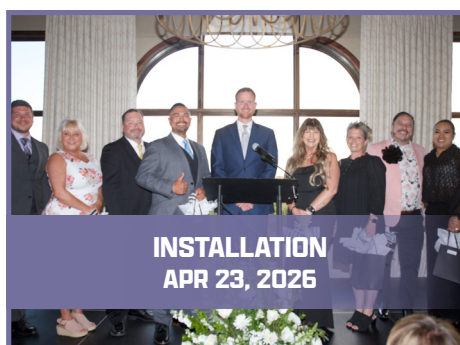
INSTALLATION APR 23, 2026