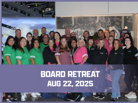
BOARD RETREAT AUG 22, 2025