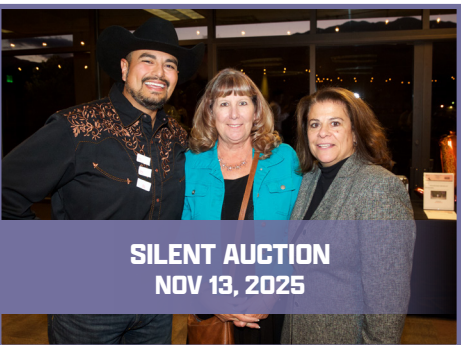
SILENT AUCTION NOV 13, 2025