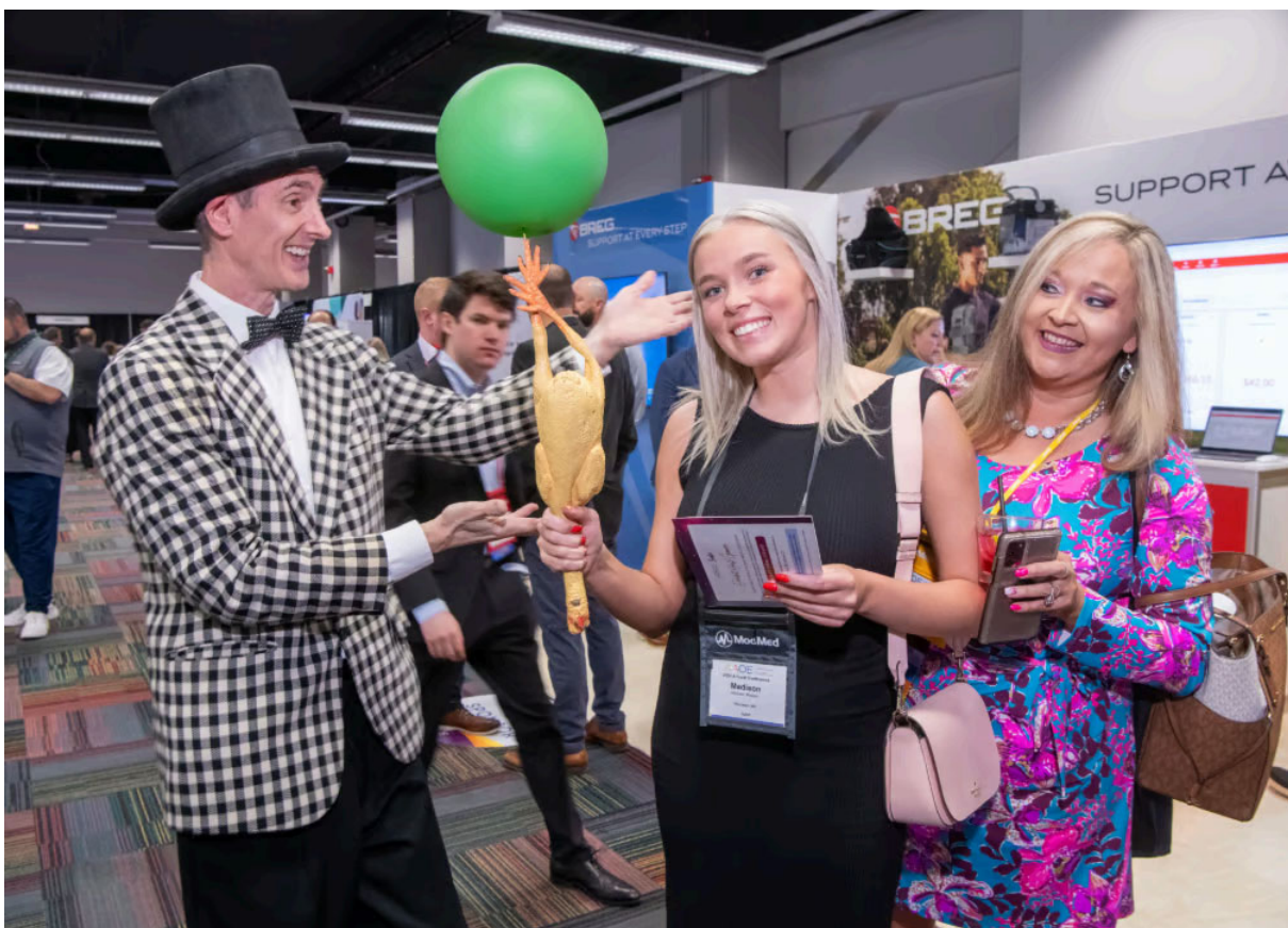
Exhibit Hall Schedule:

Remember to visit participating exhibitors to get your game card stamped! You'll be entered to win a drawing for fabulous prizes. The more stamps you collect, the greater the value of the prizes! There are over $7,000 in prizes available!