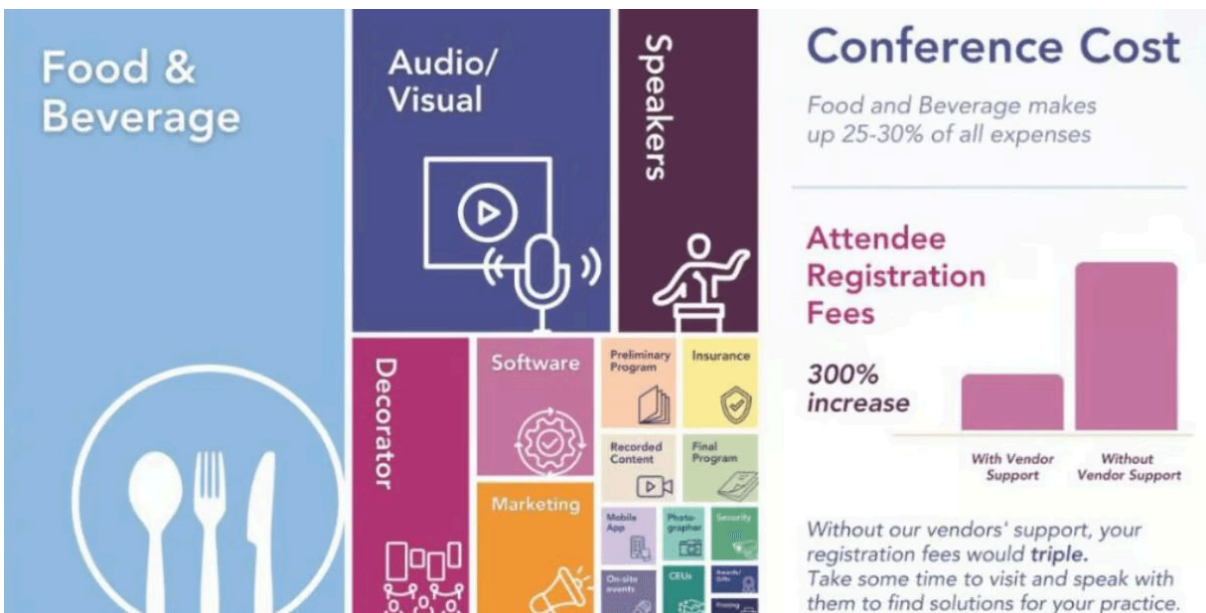
Exhibit Hall Game

Remember to visit participating exhibitors to get your game card stamped! You'll be entered to win a drawing for fabulous prizes. The more stamps you collect, the greater the value of the prizes! There are over $7,000 in prizes available!