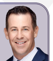
Brandon Stokley FORMER DENVER BRONCO