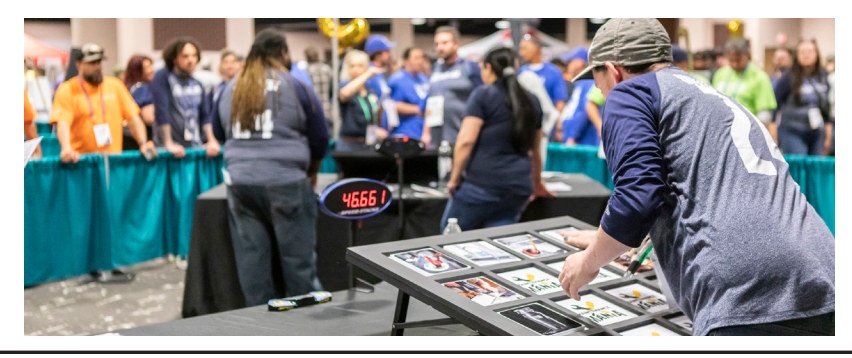
Maintenance Games are Meant for Maintenance Professionals Only