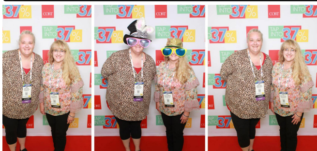
AAGW was well represented at this year's NAA Apartmentalize Conference in San Diego!