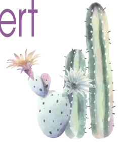
Exhibit. Sponsor. Advertise

Our return to an in-person conference last year was met with much enthusiasm. We are looking forward to another great conference this year in Tucson and invite you to join us. The 2023 AABC Birth Institute is a terrific opportunity to showcase your products/services in-person to birth center leaders and decision-makers.