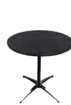
30" H Pedestal Table