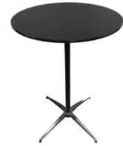
42" H Pedestal Table