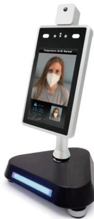
LED Desktop Stand*