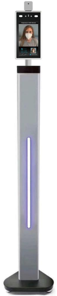
LED Floor Stand*