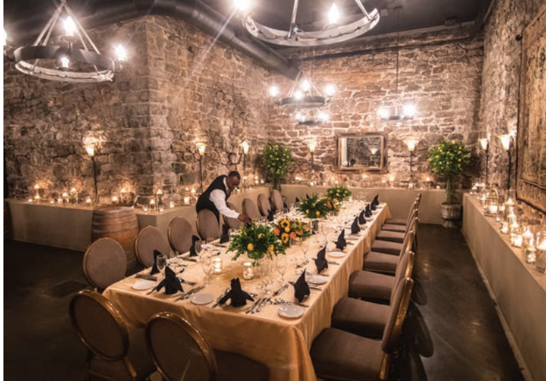
Champagne Cellar at the Winery

Main Barn & Courtyards: For up to 400 guests