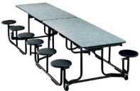
Uniframe® Cafeteria Tables

“It’s all about creating a space that each kid can make their own.” - Josh McMahon