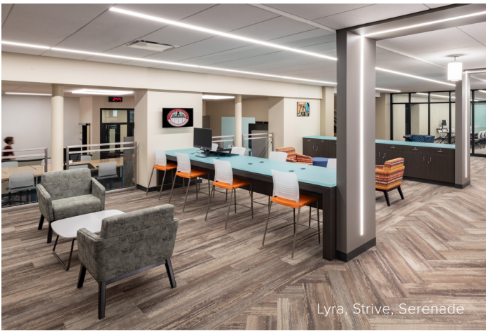
Lyra, Strive, Serenade