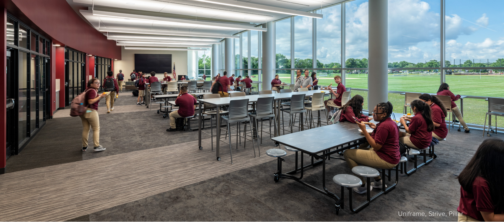
Uniframe, Strive, Pillar