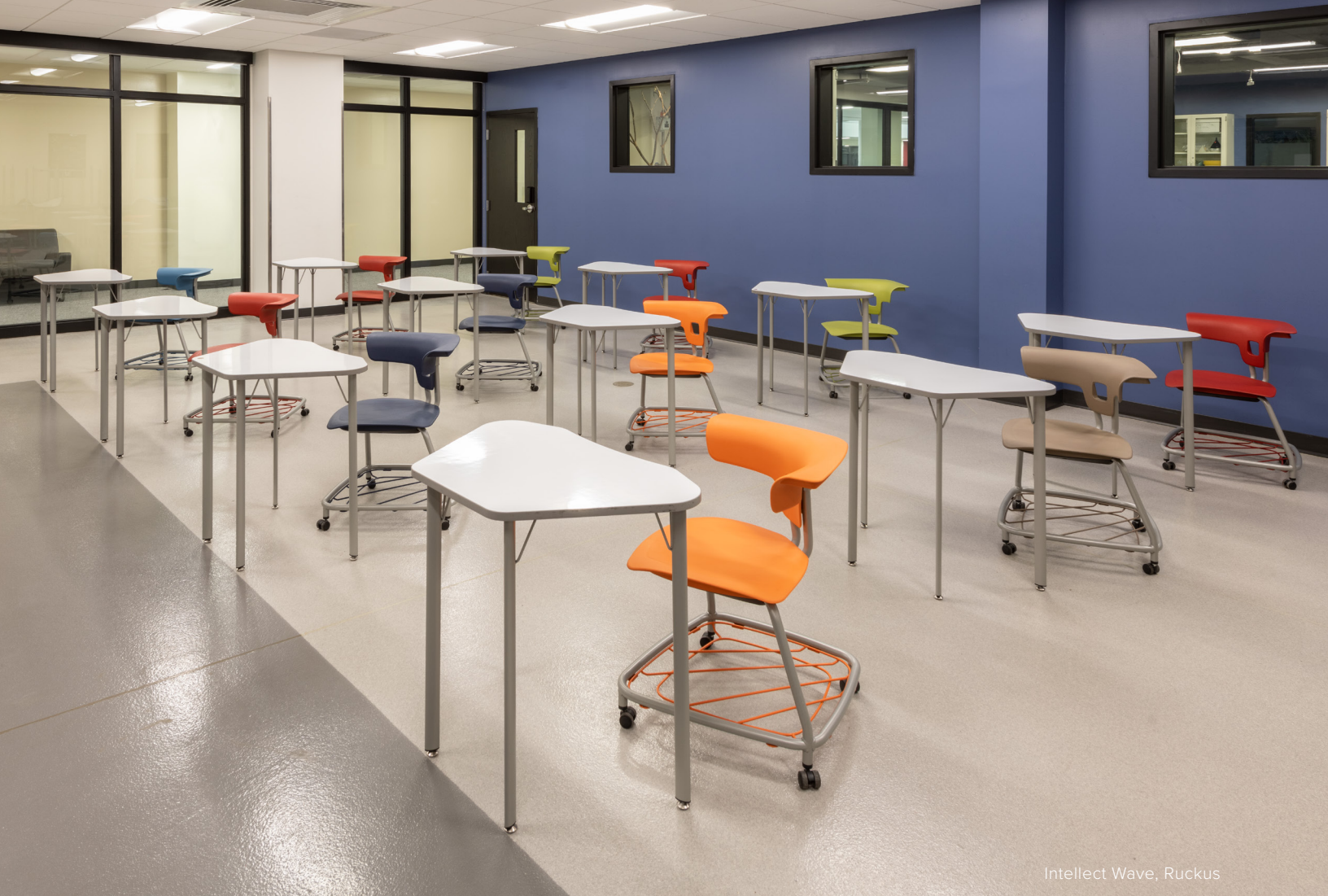
Intellect Wave, Ruckus