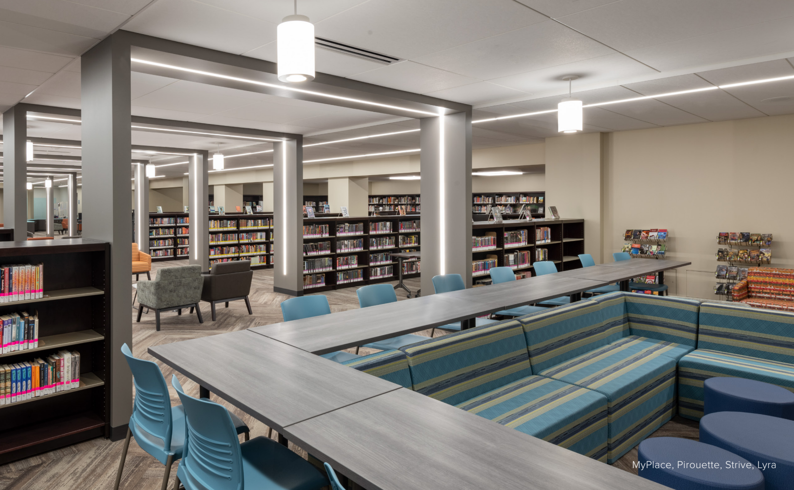
MyPlace, Pirouette, Strive, Lyra