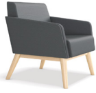
Lyra® Lounge Furniture