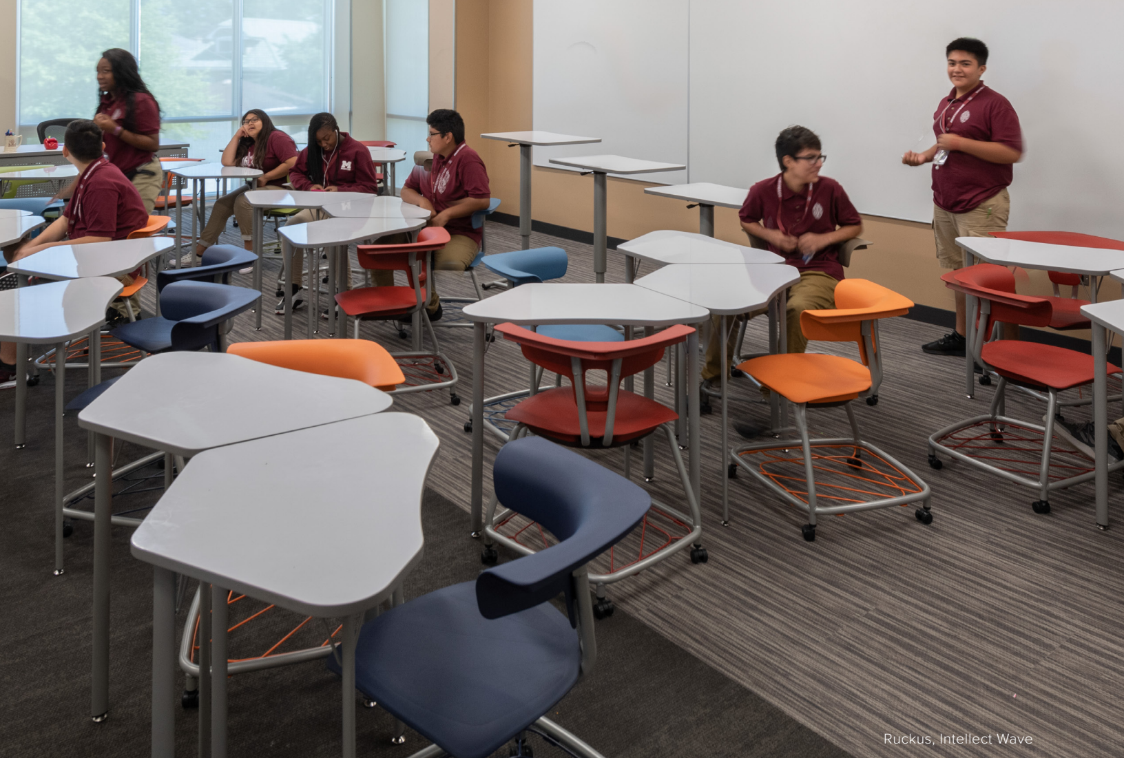
Ruckus, Intellect Wave

To do that, school leadership designed the Morton West Freshman Academy with student agency and community in mind. Above all, they wanted to create a space where freshmen could feel at home. Today, the Morton West Freshman Academy gives first-year students an inviting, communal place to call their own.