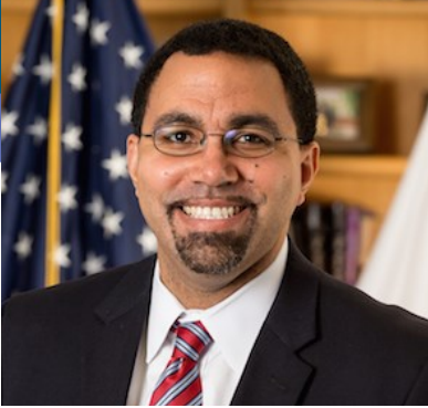
John King Former US Secretary of Education CEO, The Education Trust

John B. King Jr. is the president and CEO of The Education Trust, a national nonprofit organization that seeks to identify and close opportunity and achievement gaps, from preschool through college. King served in President Barack Obama's cabinet as the 10th U.S. Secretary of Education. In tapping him to lead the U.S. Department of Education, President Obama called King "an exceptionally talented educator," citing his commitment to "preparing every child for success" and his lifelong dedication to education as a teacher, principal, and leader of schools and school systems.